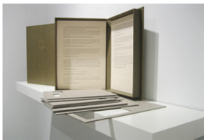
Detail, Space Other